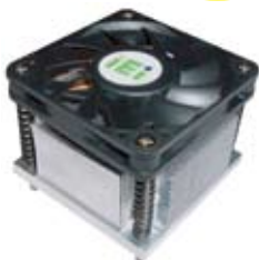
86W CF-479A-RS High Performance Socket-479 Pentium M CPU Cooler, RoHS