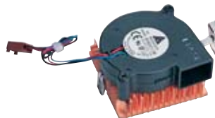
CF-507-RS Socket 478 Retention kit full metal material, RoHS