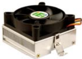
CF-515 High Performance Skiving Pentium 4-M CPU Cooler