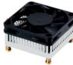
CF-518-RS High Performance Pentium-M CPU Cooler, RoHS