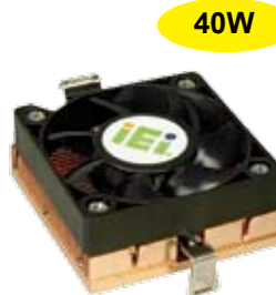
40W CF-370A-RS High Performance Slim Type Socket 370 CPU Cooler, RoHS