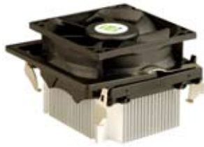
CF-519-RS High Performance Copper Core Socket 478 CPU Cooler, RoHS