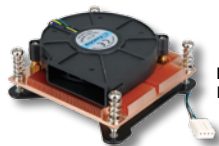
LGA1156 Cooler IEI P/N: CF-1156A-RS