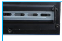
1 x Expansion slot (PCI/PCIe) 1 x Internal 2.5" HDD