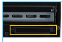
1 x Expansion slot (PCI/PCIe) 1 x CF slot